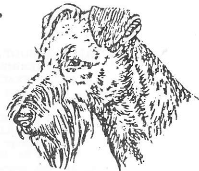
Ch. Glannagalt Anascaul Michael