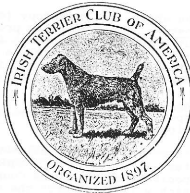
The ITCA letterhead from 1897