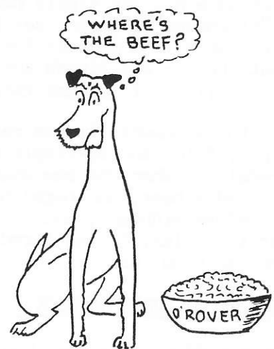
Sketches stolen from "Daredevil Messenger" (Thank you, ITCGD!)